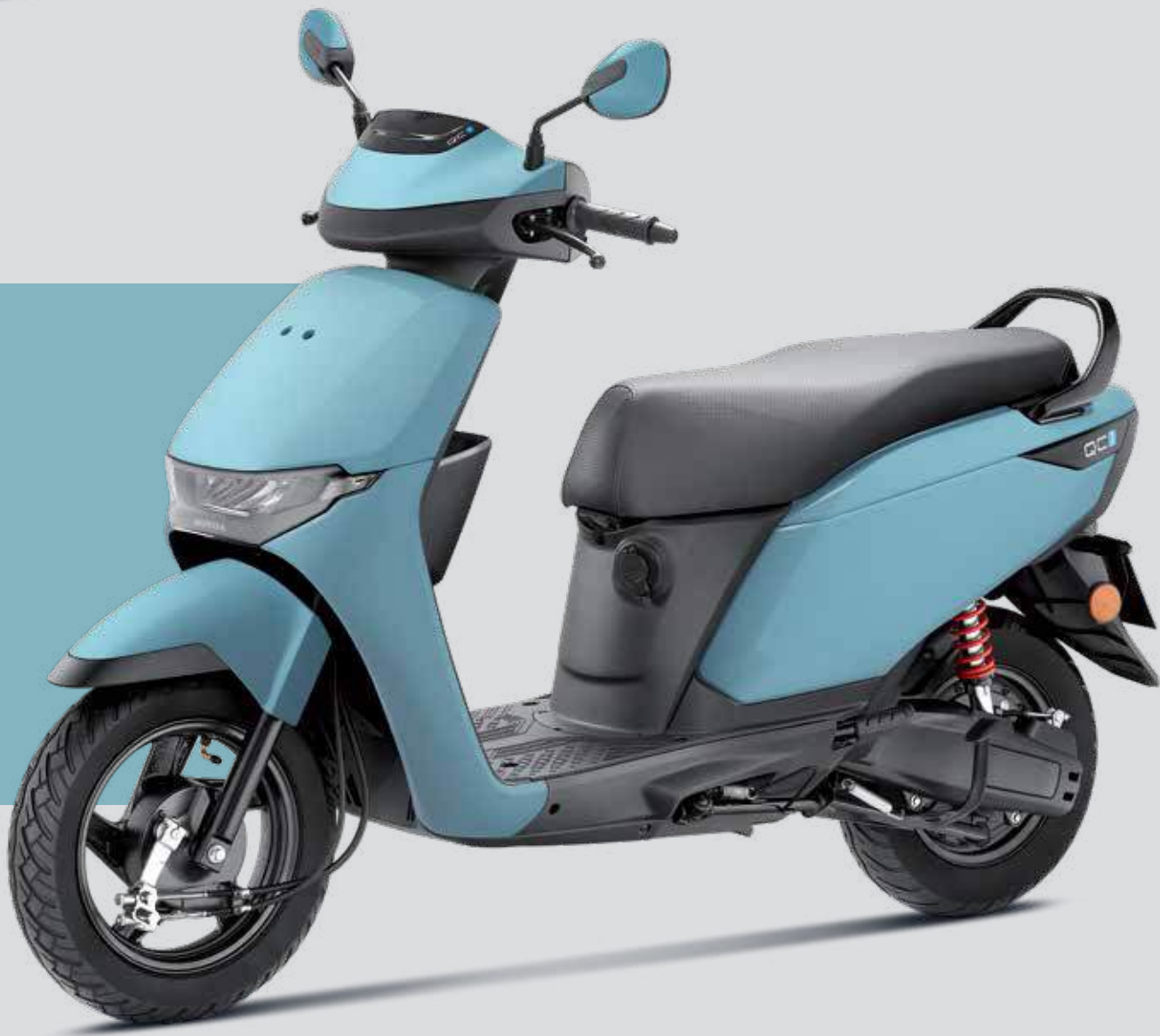
Pearl Shallow Blue