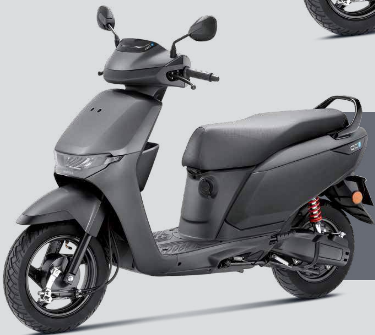
Matt Foggy Silver Metallic