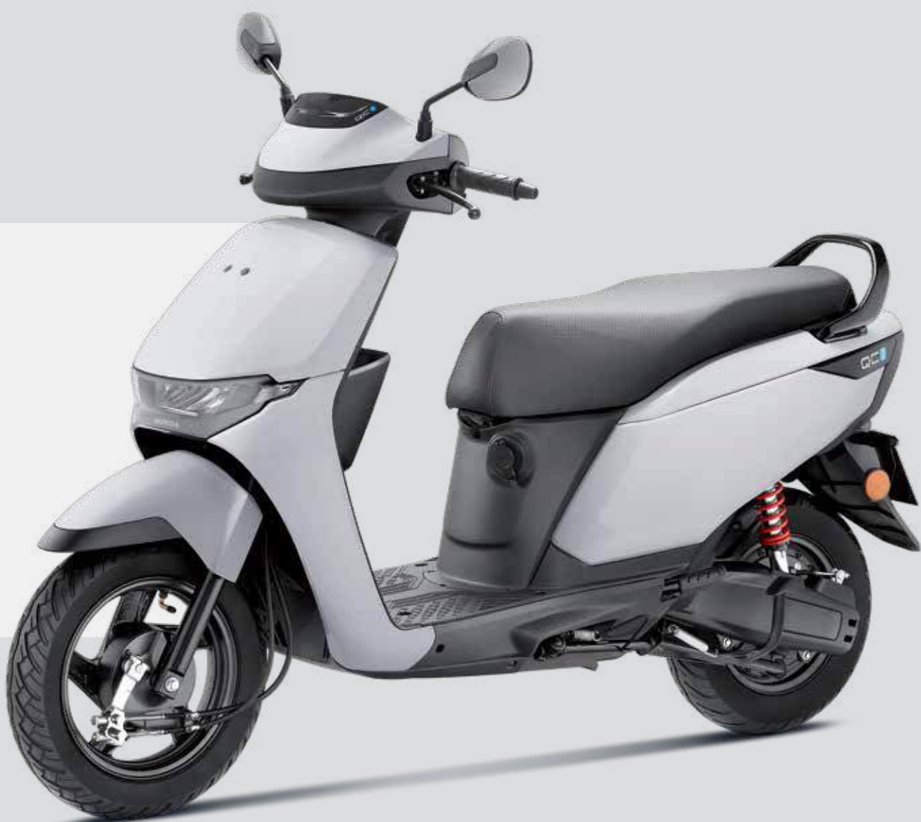
Pearl Misty White