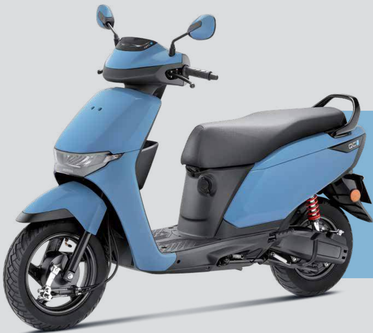
Pearl Serenity Blue

Choose from a range of stunning colours that reflect your personality.